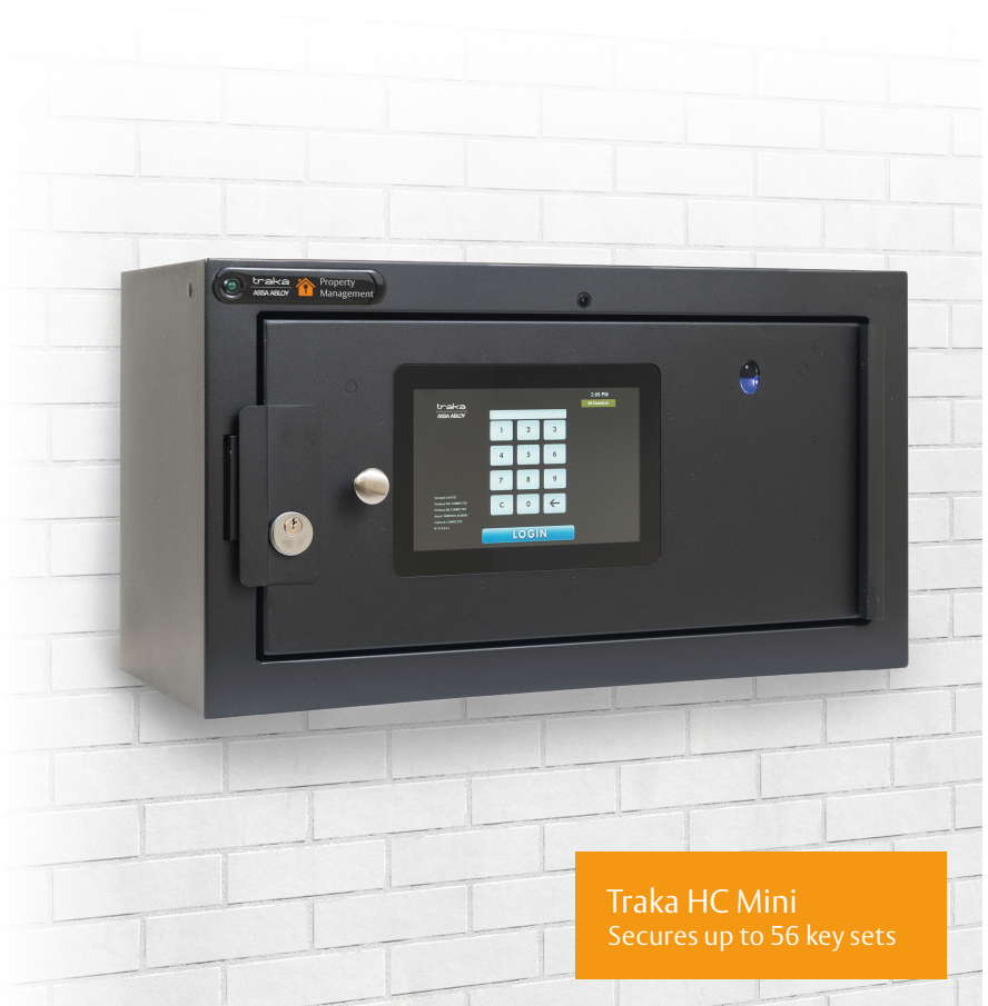
Traka HC Mini Secures up to 56 key sets