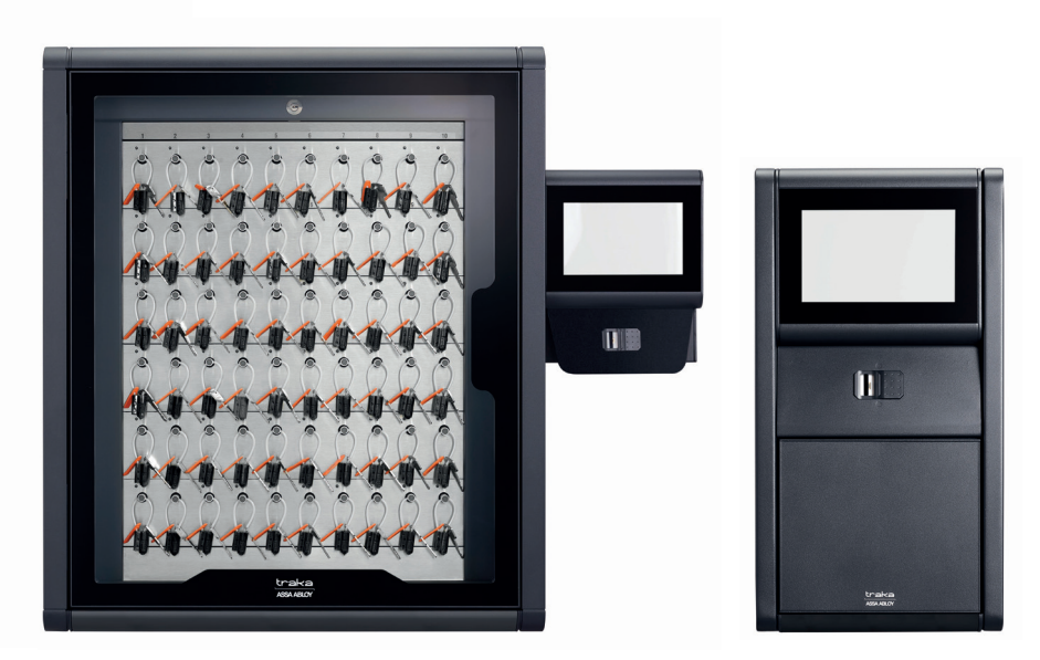
Touch Pro S (up to 480* keys)