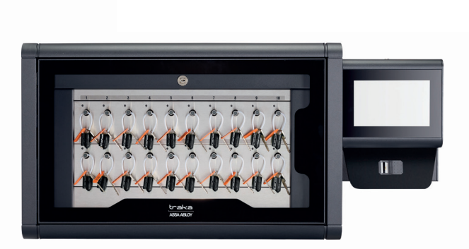
Touch Pro M (up to 40 keys)

Traka Touch Pro is our most secure and sustainable cabinet to date and is available in four different sizes, managing anywhere from 5 to 720 keys.