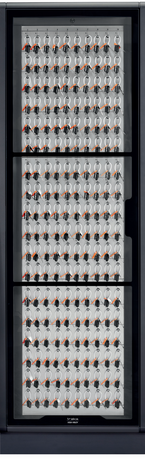
Touch Pro L (up to 720* keys)